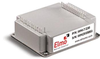
Whistle Intelligent Digital Servo Drive

The Whistle digital drive was chosen for this application, due to its compact size and ability to integrate within the constraints of the machine's interface.